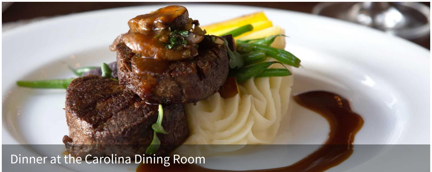
Dinner at the Carolina Dining Room

What to Wear: Lightweight golf attire, sunscreen, and sunglasses. A light jacket may be needed for the cooler morning temperatures, and it’s a good idea to bring an umbrella/rain gear just in case.