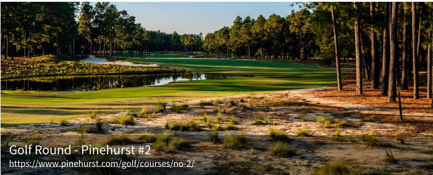
Golf Round - Pinehurst #2 https://www.pinehurst.com/golf/courses/no-2/