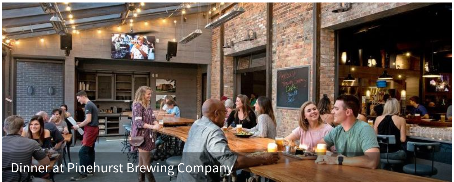
Dinner at Pinehurst Brewing Company

First Tee Time: 4:00 PM for 4 golfers Second Tee Time: 4:15 PM for 4 golfers